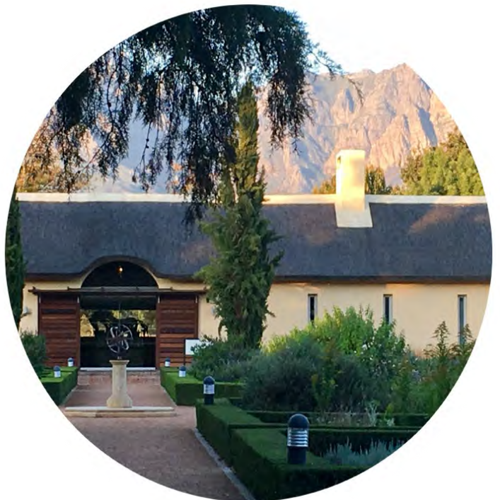
Images clockwise from top left: Hermanus, Whale watching, Stables restaurant, Anton Smit at Rossouw Modern.